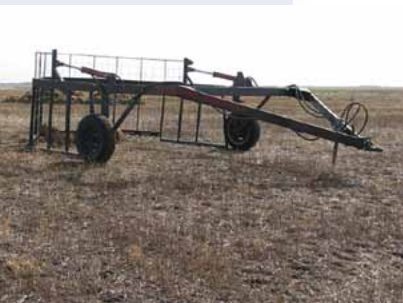
Figure 10-1: Straw Buncher

Straw disposal by burning can be used to significantly reduce flax residue. A “straw buncher” has been developed to collect windrowed flax straw into piles that can be more easily and completely burned in the field (Figure 10-1). However, if the straw is removed by burning or baling, soil may become more vulnerable to erosion if summerfallow succeeds flax. Therefore, a cereal crop following flax is required to rebuild crop residues or continuous cropping should be used with a cereal as the next crop. Recent research has shown that none of the residue management methods appear to affect the yield of a succeeding crop of wheat.