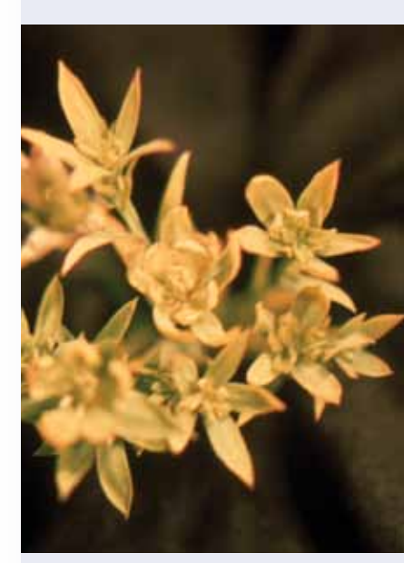
Photo 8-17–Flax Aster Yellows, petals turn to yellowish-green small leaves